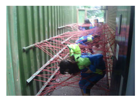
Keyworth Show - Saturday 13<sup>th</sup> July